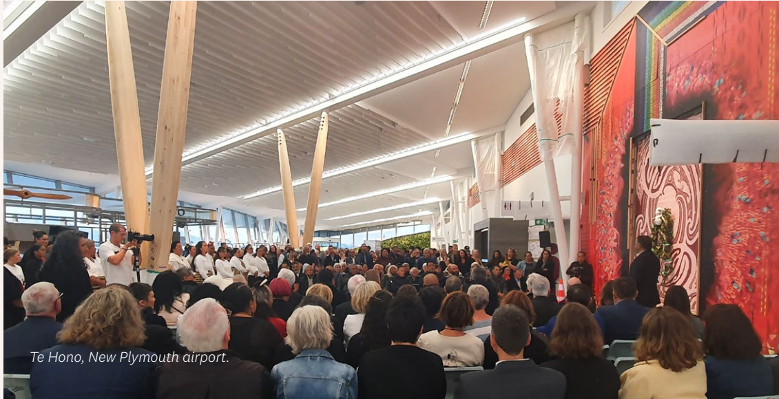
Te Hono, New Plymouth airport.

The redevelopment of Te Hono, the New Plymouth airport terminal, illustrates how a meaningful partnership between mana whenua and local government can use arts, culture, creativity and ngā toi to tell the story of the whenua and represent the distinct identity of a place.