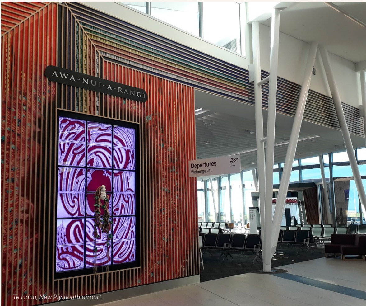
Te Hono, New Plymouth airport.

“Arts and culture is another way of making people proud to live in your region. For us in Rotorua we pride ourselves on our voice and singing ability. Temuera Morrison was in my kapa haka and that is what got him used to acting. Cliff Curtis – same thing. The tutor shared that doing the taiaha on the island turns people around.”