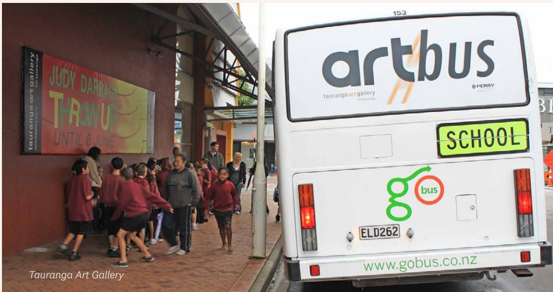
Tauranga Art Gallery

13. Resource and plan for accessibility and participation for all arts, cultural, creative and ngā toi events to share the wellbeing benefits of arts, culture, creativity and ngā toi with all of Aotearoa.