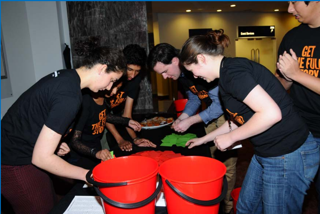
Auckland Writers Festival

The University of Auckland Festival Debate: Privacy is an Outdated Concept (2014)